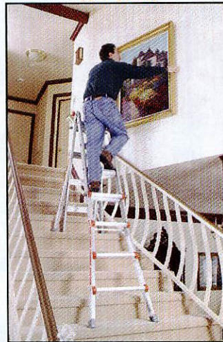
Extension Ladder (Seven Sizes)