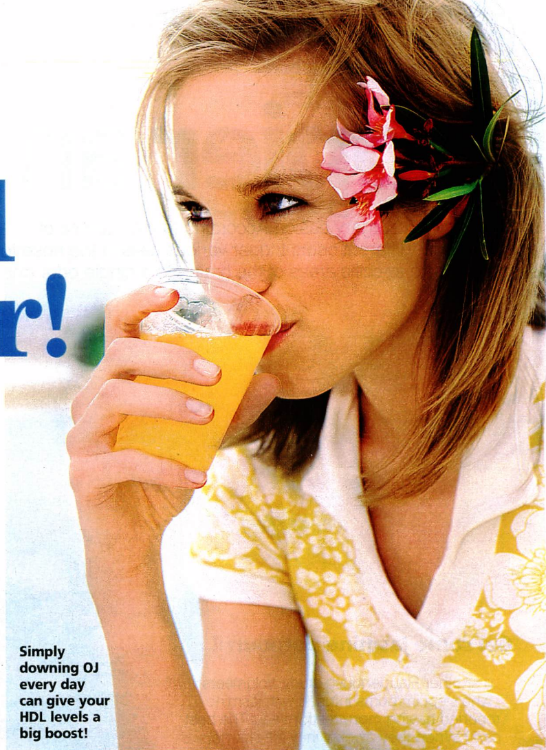
Simply downing OJ every day can give your HDL levels a big boost!

Research at Scranton University and elsewhere shows that drinking two tall glasses of cranberry or orange juice daily can raise your HDL production by at least 10%! Credit cranberry's polyphenols and OJ's flavonoids, which help boost your liver's production of HDL. This, in turn, improves your health by taking "bad" cholesterol back to the liver where it's removed from the body before it can clog arteries!